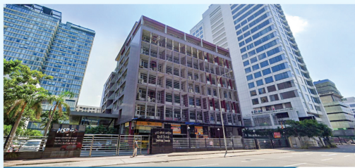
NATIONAL SAVINGS BANK 150 M