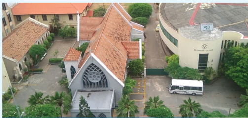
METHODIST COLLEGE 400 M