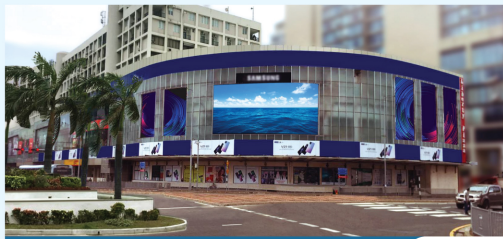
LIBERTY PLAZA 400M