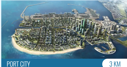
PORT CITY 3 KM